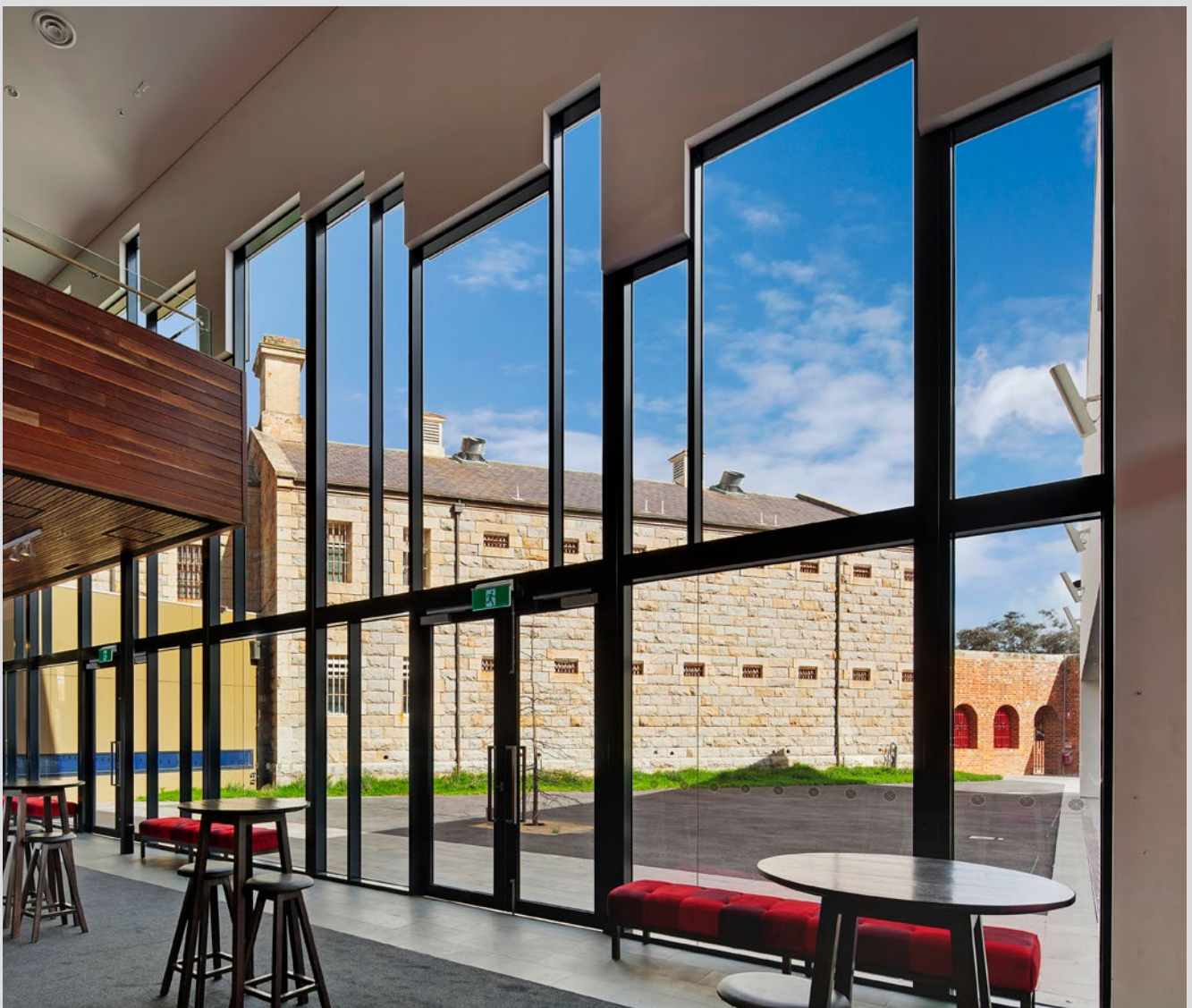
Project: Ulumbarra Theatre Bendigo Architect: Y2 Architecture Fabricator: ACMEI

These systems are tested by the National Acoustic Laboratories to provide the highest level of assurance in their performance integrity.